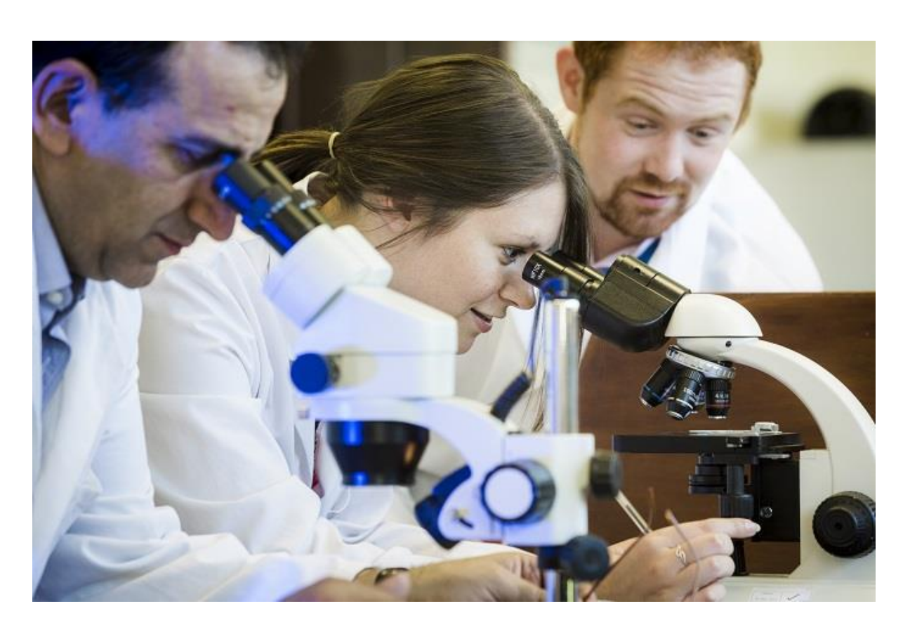
"Established in 1845, we are recognised nationally and internationally as a leader in the delivery of education, research and consultancy, in and relating to, agriculture and the rural environment".