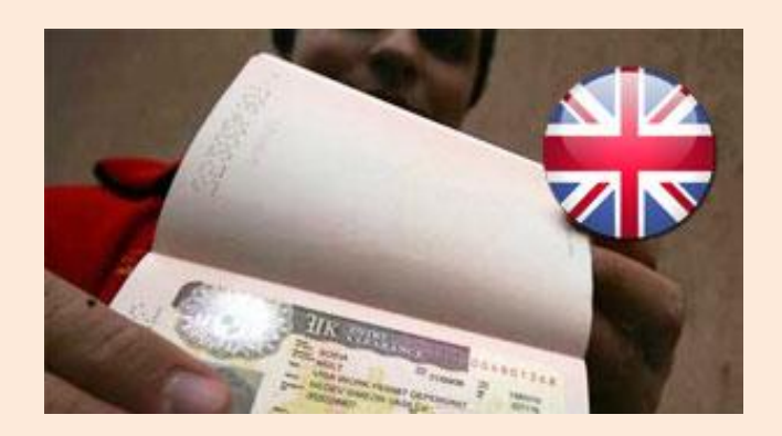
Updated 27 February 2020