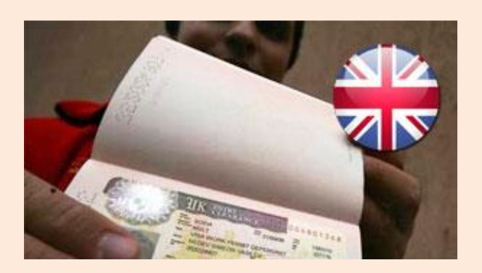
Updated 20<sup>th</sup> September 2018